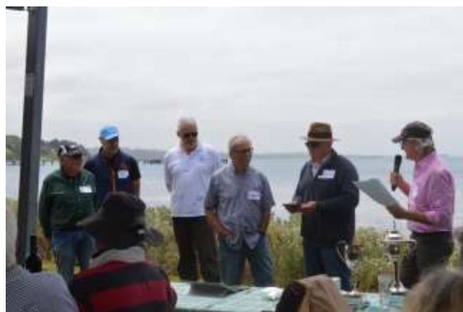
The ‘ Montalto ’ crew are rewarded for their success in the race results over the past two seasons.