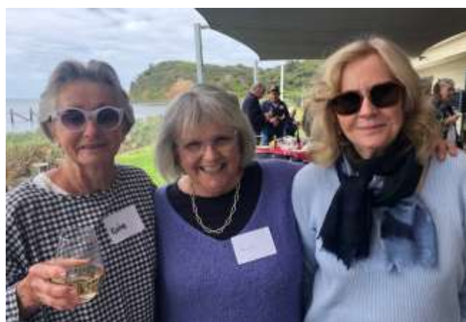
'Act of Faith' crew are suitably chuffed to receive an award.