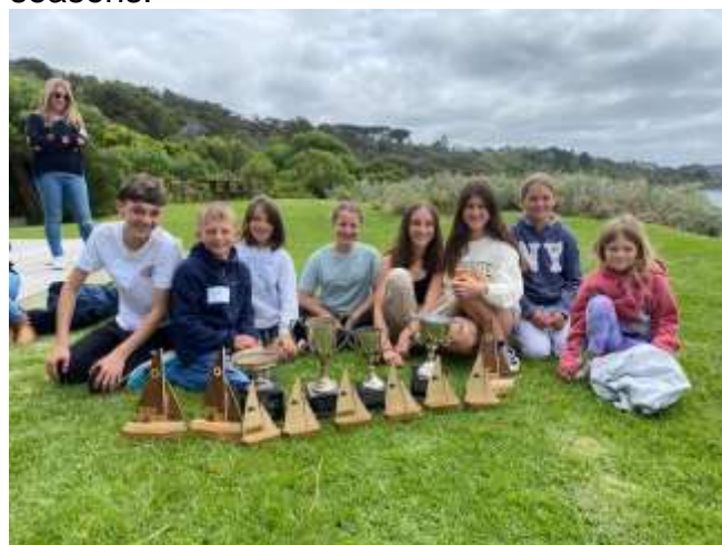
The junior sailors gathered a bounty of trophies.