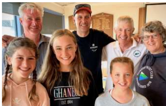
Flinders Team after the teams racing event at Somers Yacht Club.