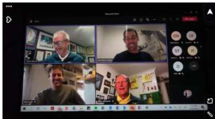
Coaching sessions for Lilly via Zoom including 470 Olympic gold medallists.

I have also been participating in many zoom meeting and webinars with the 420 Association for topics such as rules weather, tactics, strategy, fitness session and Q and A's with Olympic sailors and coaches. Theses zooms have kept me super busy as I have, mostly, had 1 per day! I hope to apply these new ideas when we can next get back on the water!