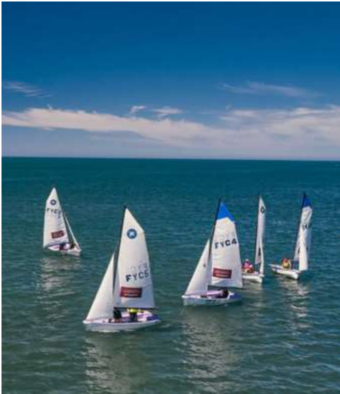
Great practice for Flinders at the Balnarring Tams Racing.