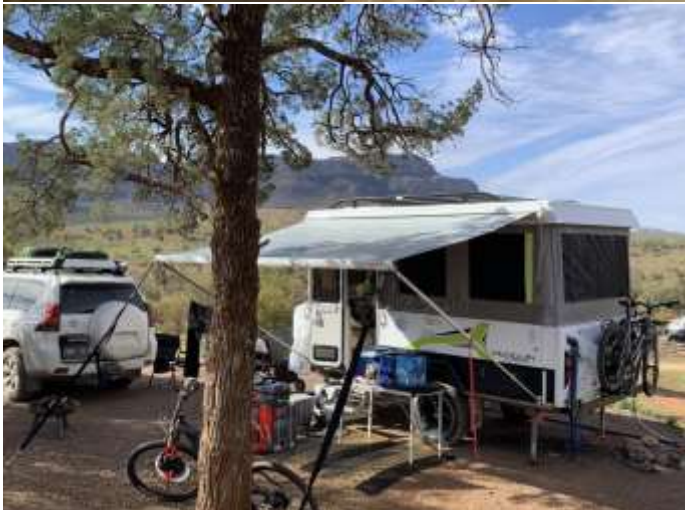
Leigh & Annie at the Flinders Ranges.

The Krokers were also keen to get away in their van and did make it to Echuca where they eyed balled the Mighty Murray but were too afraid to cross. Sadly for them their great adventure ended in a fast retreat back to Melbourne as lockdown V5 or was it V6 hit.