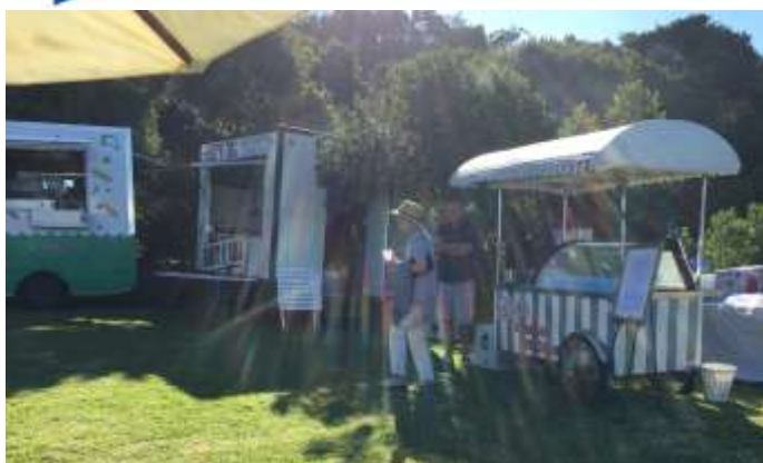
Food vans: Calamari Bros., Vietnamese, Slider and homemade Ice Creams provided delicious choices and were COVID safe.