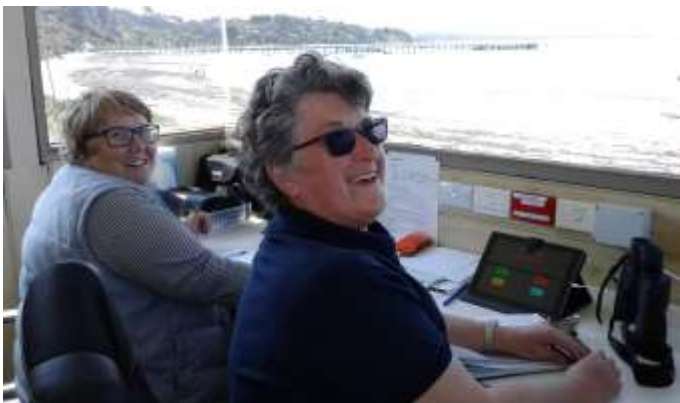
And where would we be without our Tower Volunteers to monitor the races?